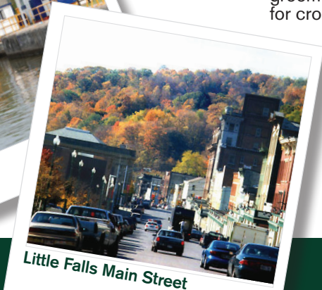
Little Falls Main Street