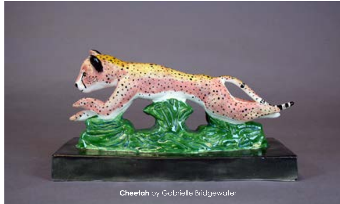
Cheetah by Gabrielle Bridgewater

The woman closed her black and gray notebook, jammed it into the bag, slammed the cover onto the pen, threw it in the bag, and stood up. She whipped the bag onto her shoulder and shouted, "Screw all of you," to the class of freshman. She stomped out the door, not looking back. Under her breath, she mumbled a choice of profane language and continued out the door and down the hall. The student appeared to have tears in her eyes when she left, but balled up her fists at the same time. The class laughed it off, as they were only making a joke that the student took too far. The class continued, and brightened once the dull student left. ● ● ●