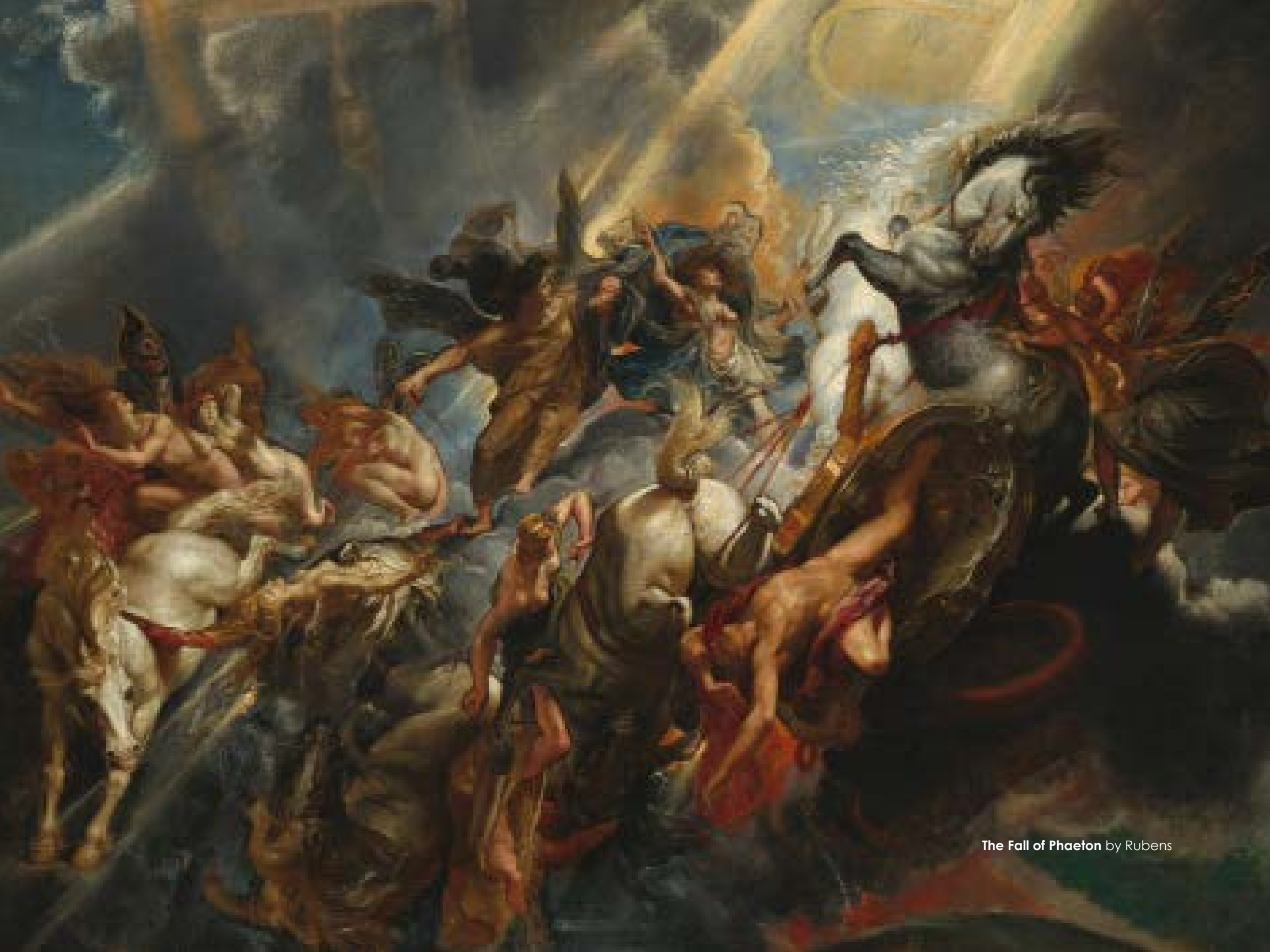
The Fall of Phaeton by Rubens