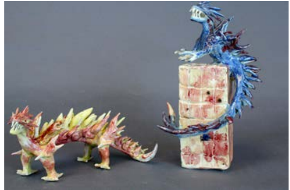
Two Dragons by Joichi Ikenoue

Five, seven then five These poems are easy to write I'm a lazy fuck