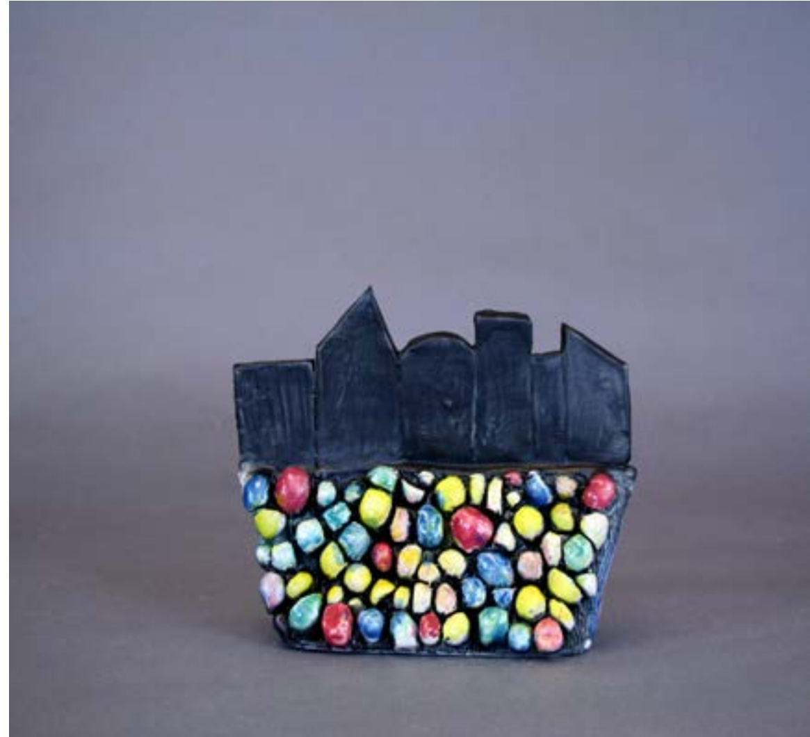
City Lights by Milndlis Diese