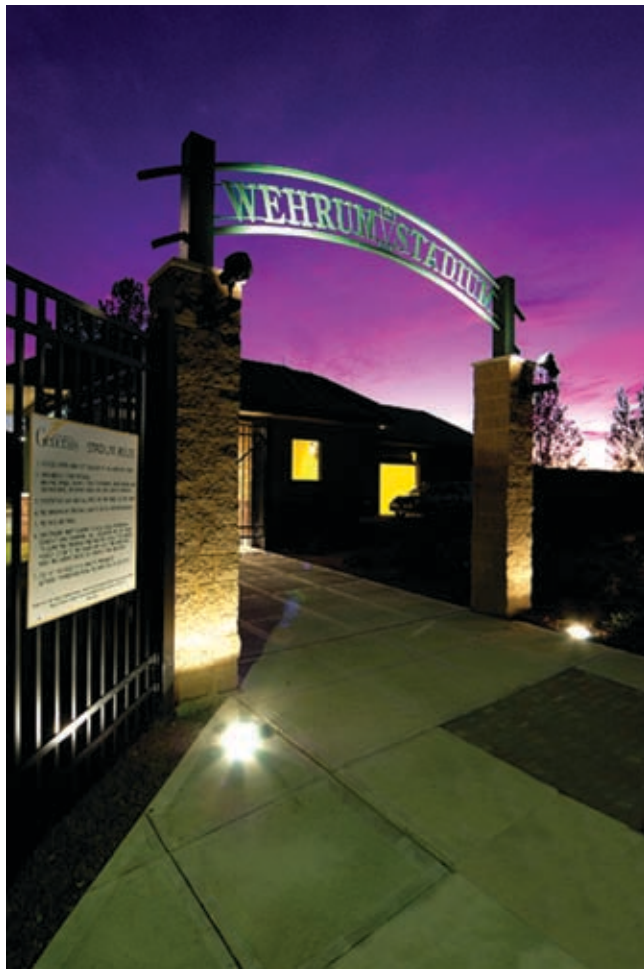
The sun sets on the entrance to HCCC's Wehrum Stadium.