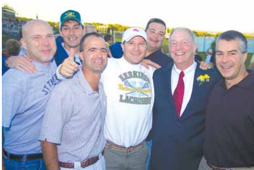
Wehrum Stadium —An archway marks the entrance to Wehrum Stadium (left). At right, fans gather in the new stadium for a men's NJCAA soccer game, following fireworks and the stadium dedication ceremony.