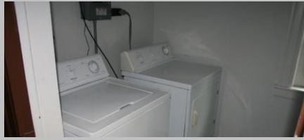
WASHER AND DRYER ON PREMISES AT EACH LOCATION