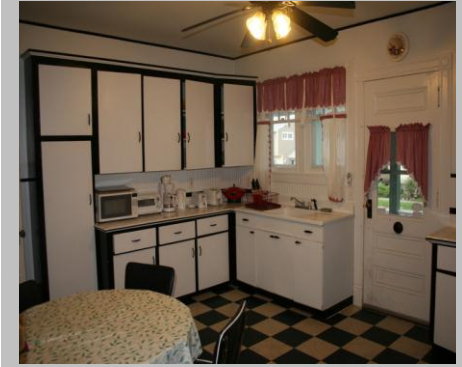
FULLY OUTFITTED KITCHEN