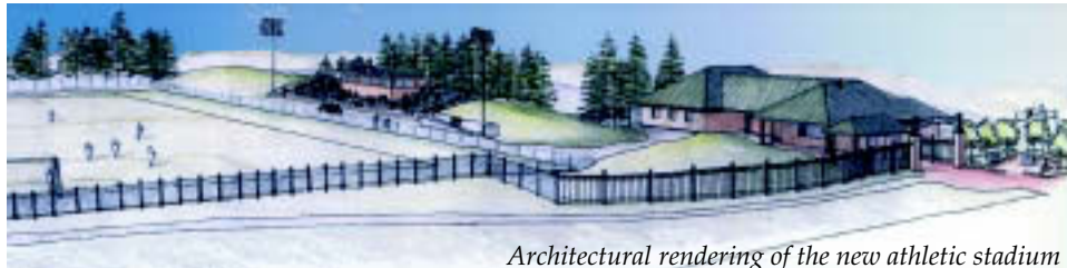
Architectural rendering of the new athletic stadium