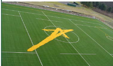
HCCC's new artificial turf field.

Donors have the opportunity to purchase commemorative bricks. The engraved bricks will be placed together in HCCC's new stadium complex. Bricks may be engraved with up to three lines of 20 characters each.