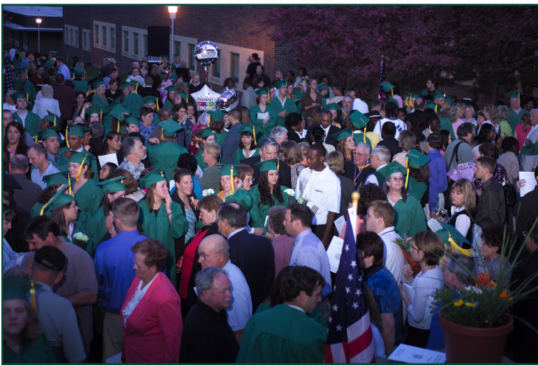
Crowds gather following the 2005 commencement exercises. HCCC graduated 558 students. (above)