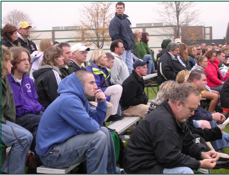
Lacrosse Fans Unite — Alumni, parents and fans get a sneak peak at the 2004-05 men's lacrosse team at the annual Green & Gold game.