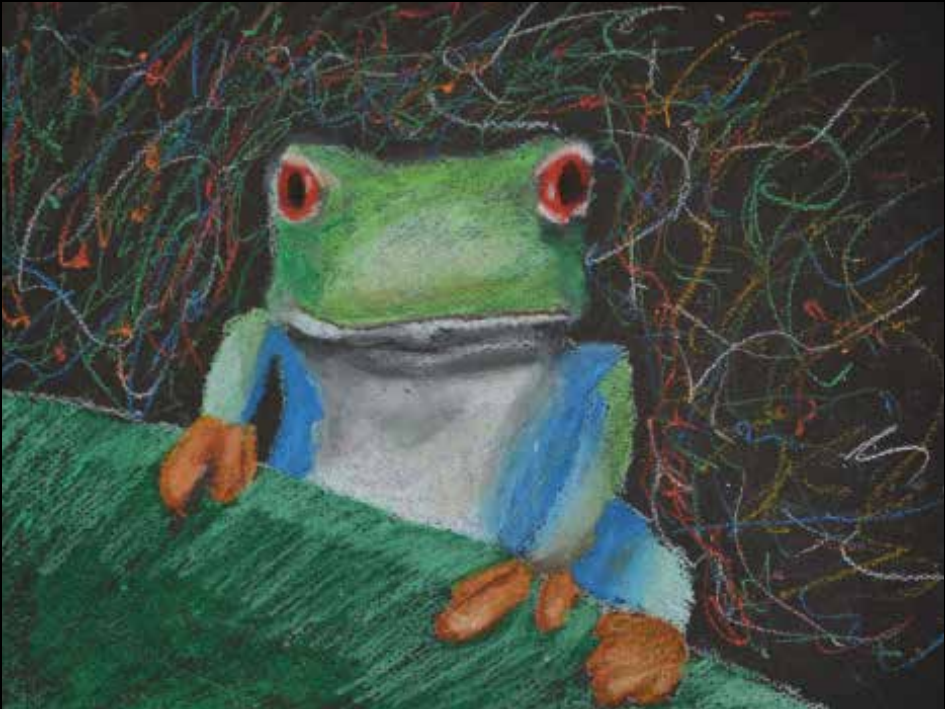
Electric Frog |