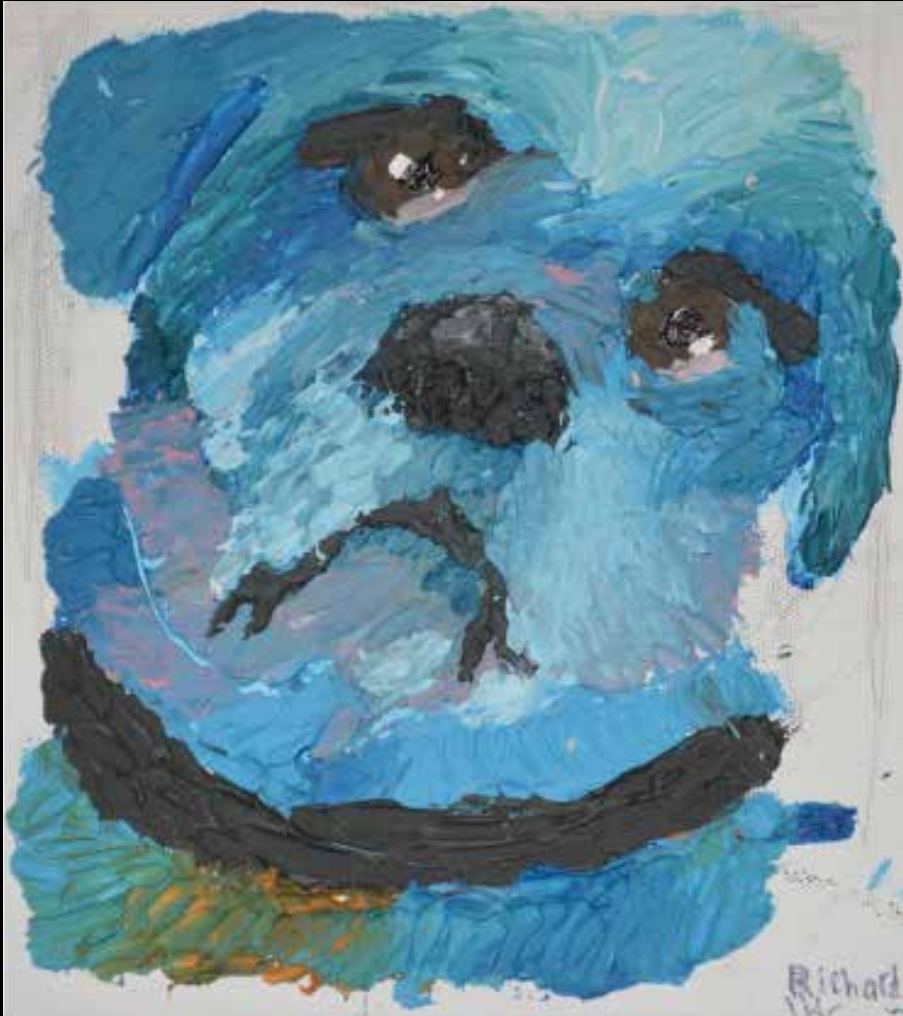
| Blue Terrier