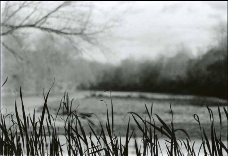
Black and White Film Traditional Darkroom Processing