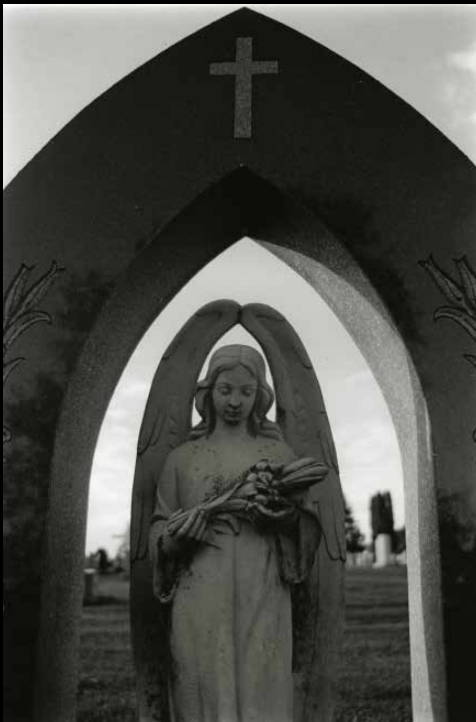
Black and White Film Traditional Darkroom Processing