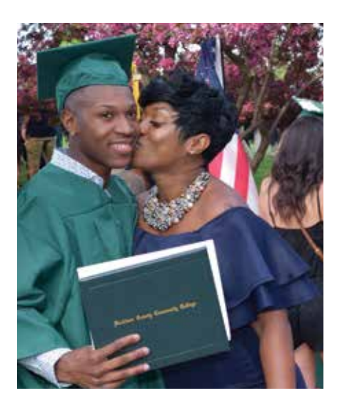
To view photos and video, go to www.herkimer.edu/commencement.