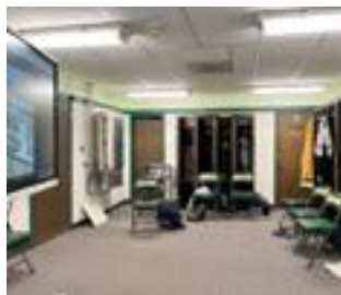
men's team room