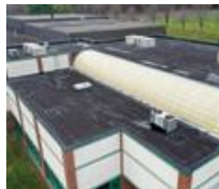
PE building roof