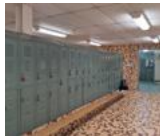
women's locker room

"We are excited about the new and renovated athletic facilities as they will create many new opportunities for Herkimer College in terms of hosting events and student recruitment. Though infrastructure projects are not as exciting, they are critically necessary for the health and safety of our students and campus community.