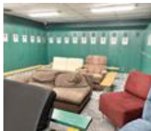
men's team room