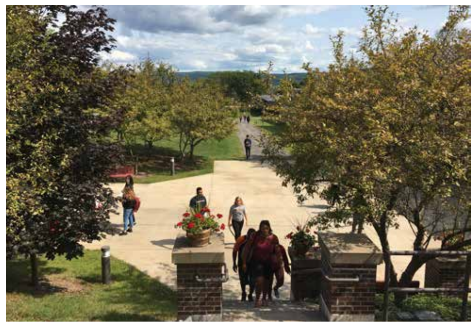
Overlooking the beautiful Mohawk Valley, Herkimer College sits on a 500-acre campus. Visit us soon!